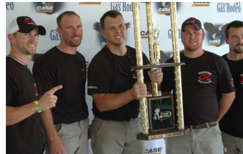
Insane Methane Piedmont Natural Gas