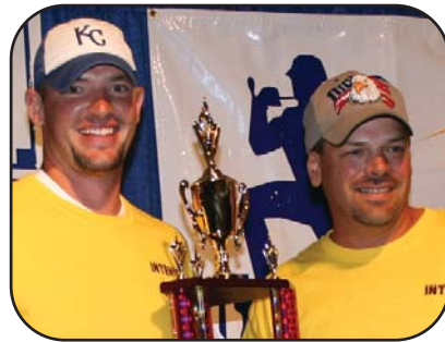
Intense Missouri Gas Energy