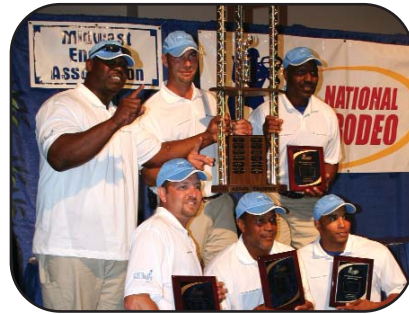
Trouble Shooters Atlanta Gas Light

Welcome to the 2008 National Gas Rodeo! Our committee, judges, and volunteers have put together excellent events to test your competitive skills.