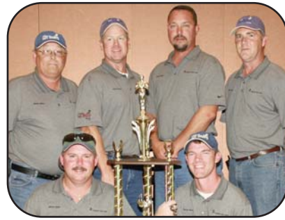
Meter Nuts Atlanta Gas Light