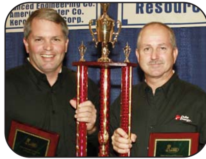
Mud Puppies Duke Energy